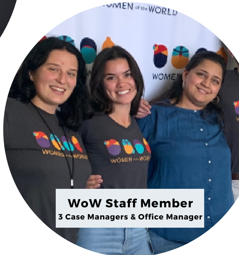
WoW Staff Member