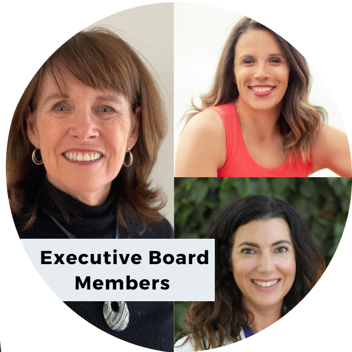
Executive Board Members

Women of the World's diverse coalition of staff and Board members are willing to represent WoW at functions and speaking engagements. We ask for a minimum of 2 weeks for a WoW representative to present at a function or event. However, if you would like a specific representative, we ask for a 1-month notice in order to accommodate their schedules.